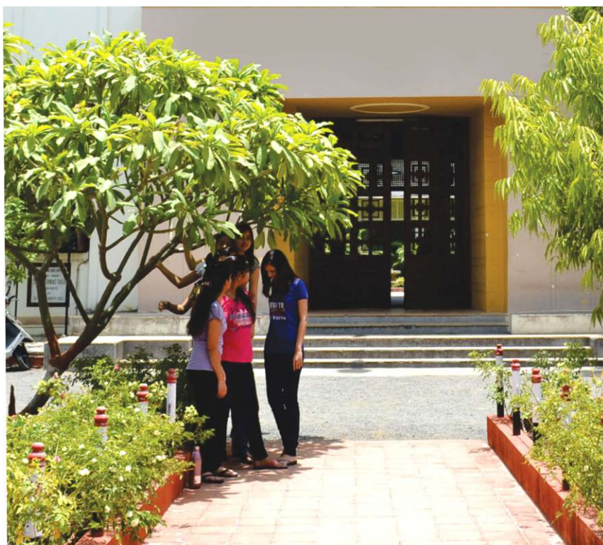
WOMEN'S EDUCATION SOCIETY'S HOSTEL SEMINARY HILLS CAMPUS

Women's Education Society runs a hostel which is located in the beautiful campus at Seminary Hills. It provides accommodation to around 200 students. The hostel has a main garden in front of the building and a canteen in rear vicinity. The hostel has extensive sports facilities for outdoor games like badminton, throw ball, basket ball, etc. The mess of the hostel provides vegetarian meals, snacks and tea.