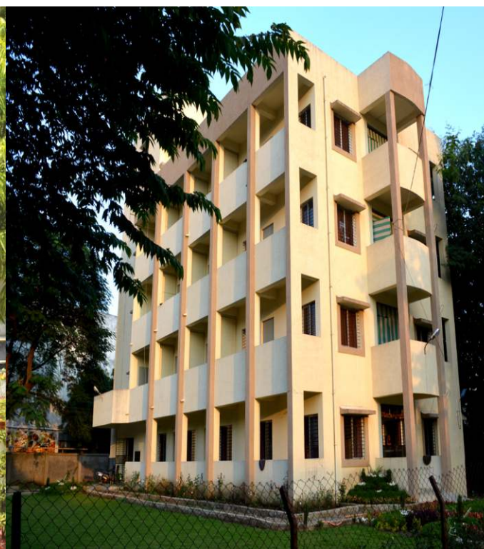
L.A.D. & SMT. R. P. COLLEGE FOR WOMEN - HOSTEL SHANKAR NAGAR CAMPUS

Women's Education Society runs a hostel which is located in the beautiful campus at Seminary Hills. It provides accommodation to around 200 students. The hostel has a main garden in front of the building and a canteen in rear vicinity. The hostel has extensive sports facilities for outdoor games like badminton, throw ball, basket ball, etc. The mess of the hostel provides vegetarian meals, snacks and tea.